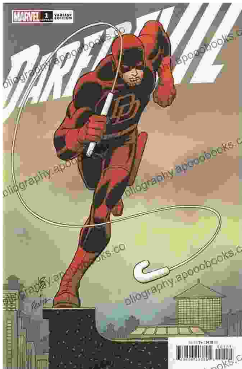
Daredevil Cover by John Romita Sr.

You'll marvel at the dynamic compositions of John Romita Sr. and the gritty realism of Frank Miller. Each page is a work of art, transporting you into the vibrant and thrilling world of Hell's Kitchen.