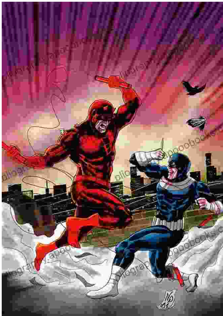
Daredevil vs. Bullseye by Frank Miller and Klaus Janson

In this collection, you'll witness Daredevil's electrifying battles with these iconic foes, depicted with stunning detail and heart-stopping action sequences.