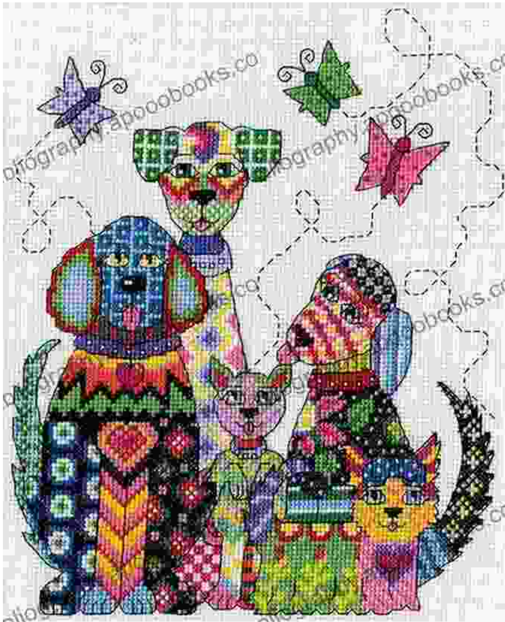
Counted Cross Stitch Pattern: Watercolor Dog #156 - Poodle: 183 Watercolor Dog Cross Stitch Series