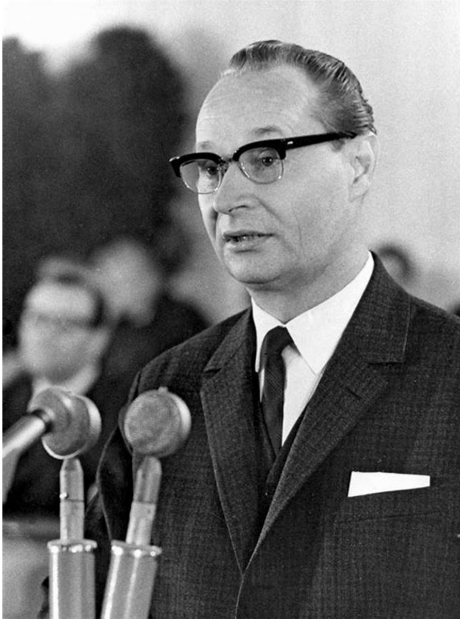
Alexander Dubček, the leader of the Prague Spring.